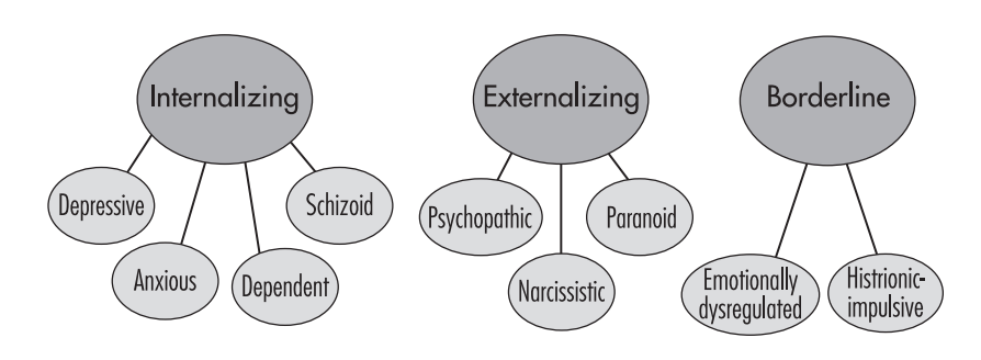
FIGURE 4–2. Hierarchical structure of personality syndromes.

acknowledging or expressing anger). The depressive (or dysphoric) personality syndrome appears to have its origin in late childhood or early adolescence (Westen et al. 2005) and appears to be stable and enduring over time. In short, it is a personality disorder by every definition of the term (cf. Huprich 2003, 2005; Huprich and Frisch 2004; McDermut et al. 2003; Ryder et al. 2001).